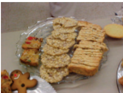
Christmas Baked Goodies